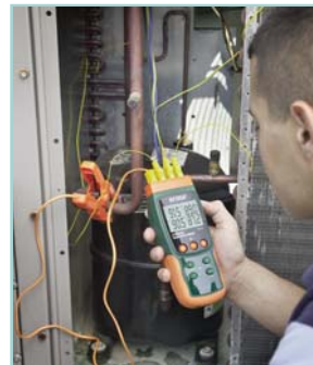
Simultaneously measures 4 temperature inputs for multiple source monitoring